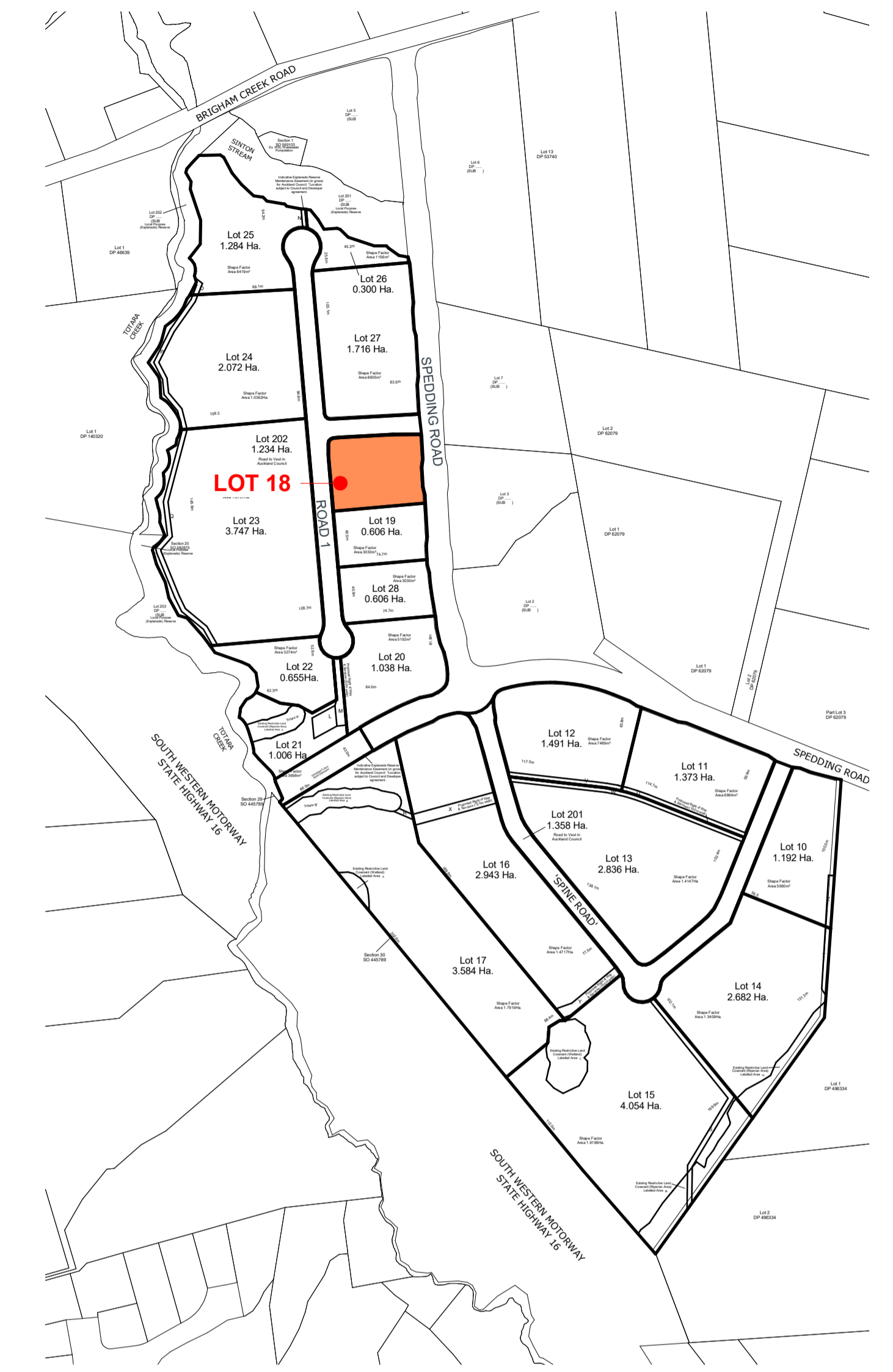
LOCATION PLAN LOT 18 SCALE @ A1: 1 : 5000