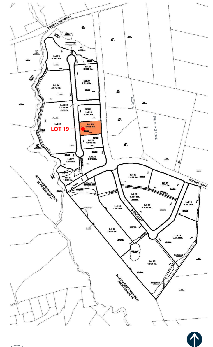
LOCATION PLAN SCALE @ A1: 1 : 5000